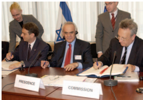
Signature Agreement on Scientific and Technological Cooperation between the European Community and the State of Israel, October 2003

Extract from the interim report on the “EU Strategic Partnership with the Mediterranean and the Middle East,” agreed by the Council of the European Union at its meeting of March 22, 2004