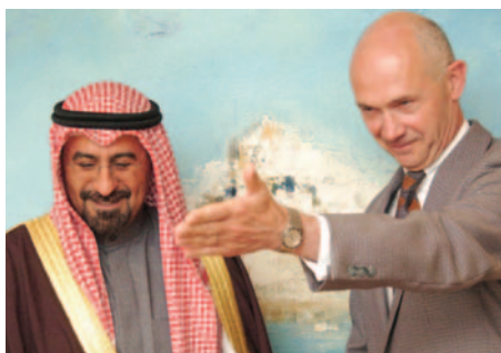
Pascal Lamy, EU Trade Commissioner receives Muhammad Sabah Al-Salim Al-Sabah, Kuwait Minister for Foreign Affairs and Secretary General of the Cooperation Council for the Gulf Arab States, Brussels, April 2004

Europeans – Working Together - Address by the Taoiseach, Mr. Bertie Ahern, T.D., to the European Parliament January 14, 2004