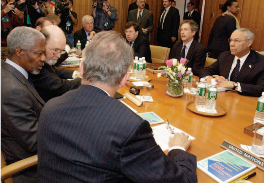
Members of the Quartet met May 4, 2004, in New York to discuss Middle East issues.